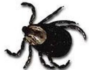
Ticks can cause harm to both you and your pet.

It is your choice which preventative you choose to use for your pet.